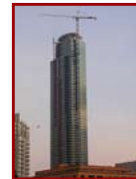
One Rincon Hill 709 units