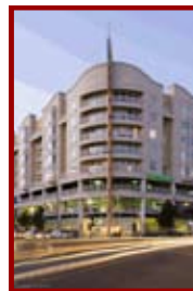
Avalon Towers 226 units