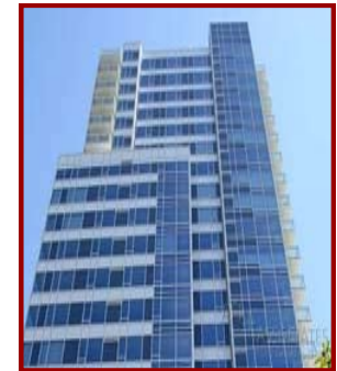
The Watermark 136 units