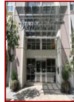
The Bridgeview 245 units