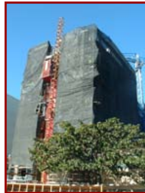
766 Harrison 98 units