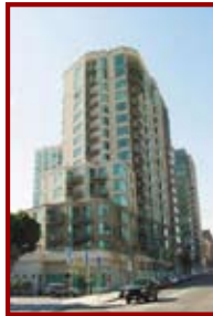
The Brannan 336 units