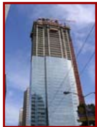
Millenium Tower 440 units