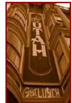
Hotel Utah Saloon