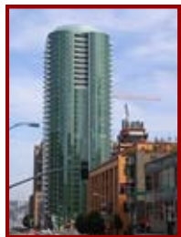
Infinity I & II 710 units