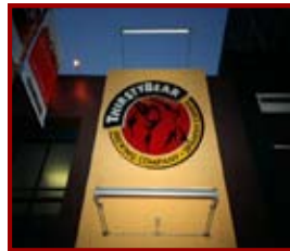
The Thirsty Bear