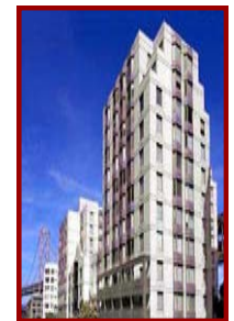
The Baycrest 100 units