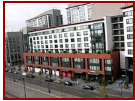
The Beacon 595 units