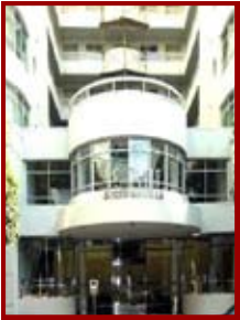
The Portside 200 units